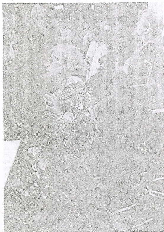
One of the thousands who attended the healing mass in SS Peter & Paul's Church, Monasterevin is deep in prayer during the service.