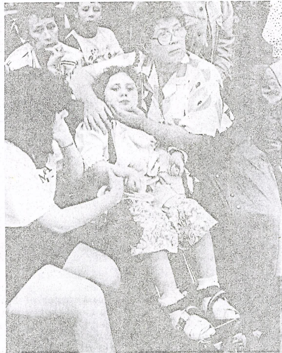
Thousands of people attended the healing mass in S.S. Peter & Paul's Church, Monasterevin, many in wheelchairs like this young girl who is being attended by friends.